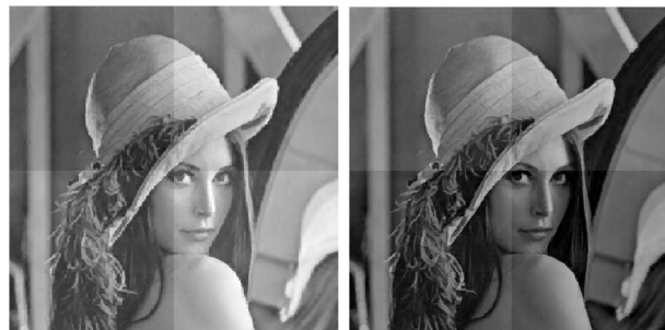
Fig. 2. Lower and upper Lena images.

As it happens for single-valued function, it might happen that the color of a single pixel is difficult to be determined; this leads to consider the measure of a block of pixel and then, quite naturally, to introduce the definition of positive multimeasure.